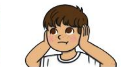
noisy / loud