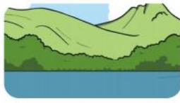
restful / peaceful