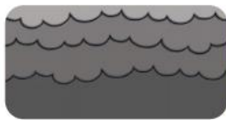
gloomy / dark