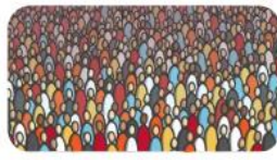
crowded / busy