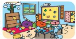
untidy / messy