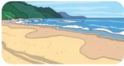
warm / sunny / pleasant

Look at the words below and use some for the 3 settings. Add your own words to the lists.