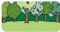
quiet / peaceful