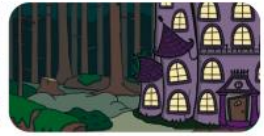
spooky / haunted / creepy