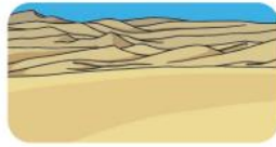
hot / humid / sticky