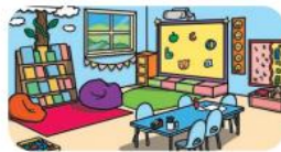
tidy / neat