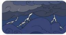
windy / gusty / stormy