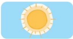
dazzling / bright