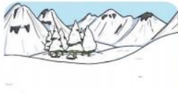
cold / snowy / wintry