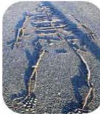
Sticks and twigs outside.