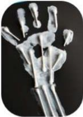
Paint handprint and Cotton buds