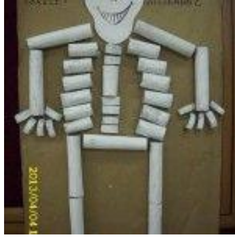
Painted cardboard tubes. You could use rolled up paper.