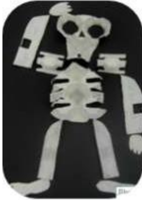
Cut white paper to size and shape and glue to a dark background.