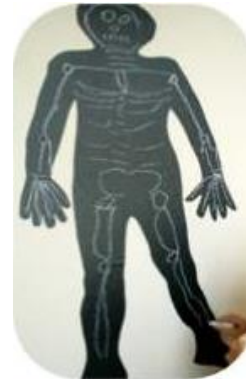
White chalk on dark paper/card.