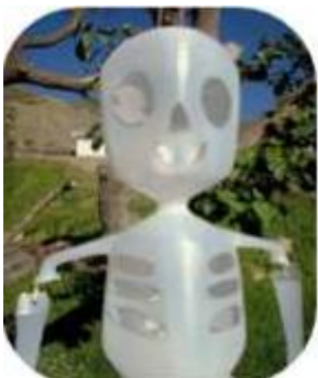
Plastic milk bottles.