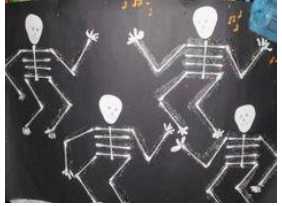
Glue cotton buds to a dark background.